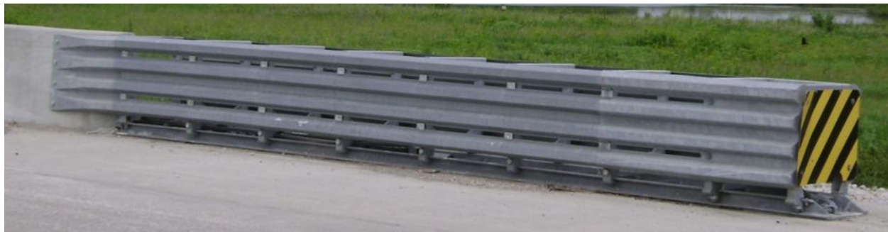
Figure 1: A typical crash cushion.

Crash cushions are used within the clear zone of approaching traffic where an obstacle exists that cannot be moved, made breakaway, or otherwise protected with a longer barrier. They are designed to dissipate the energy of a vehicle either partially during a side impact or fully in the case of a head-on impact. Obstacles that are commonly shielded with crash cushions include bridge rail end sections, temporary barrier rail (TBR) ends, and concrete barrier ends.