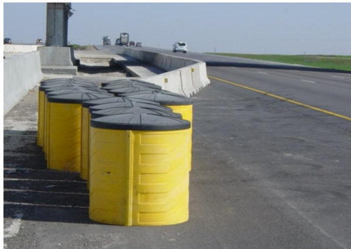
Figure 2: Sand filled barrel arrays are adaptable to many types of obstacles.

For design purposes, assume that a non-redirective crash cushion is equivalent to a sand filled barrel array. Sand filled barrel arrays can be installed either on pavement or on a dirt pad. If a barrel array will be located behind a curb, the curb must be ground to a 4 inch sloped curb adjacent to, and for 50 feet in advance of, the barrel array. If the barrel array will be located fully or partially off existing pavement, provide a graded dirt pad as shown on Standard Road Plan BA-500 .