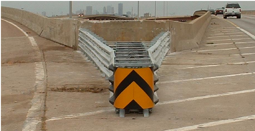
Figure 5: A crash cushion shielding a gore area.

For the crash cushion in shown Figure 5, the ends of the concrete barriers were located approximately 10 feet apart, so the contractor was required to install a wide crash cushion to protect this entire width. This added significantly to the cost of the crash cushion and makes repairs more difficult. Therefore, whenever possible, extend existing or proposed barriers closer together so that a standard width crash cushion can be used. The most preferable condition is to bring the barriers together and transition to a 24 inch wide, 30 inch long, vertical faced block. Contact the Methods Section for details.